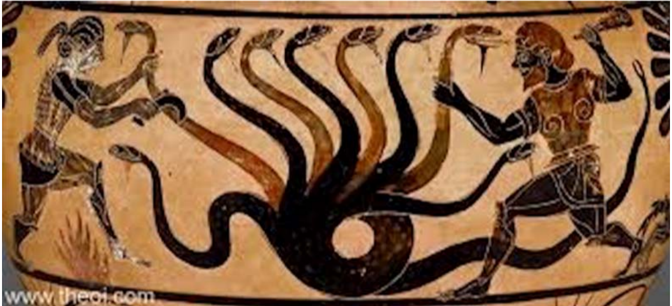
Multiplicity of Lies: Heracles battling Hydra