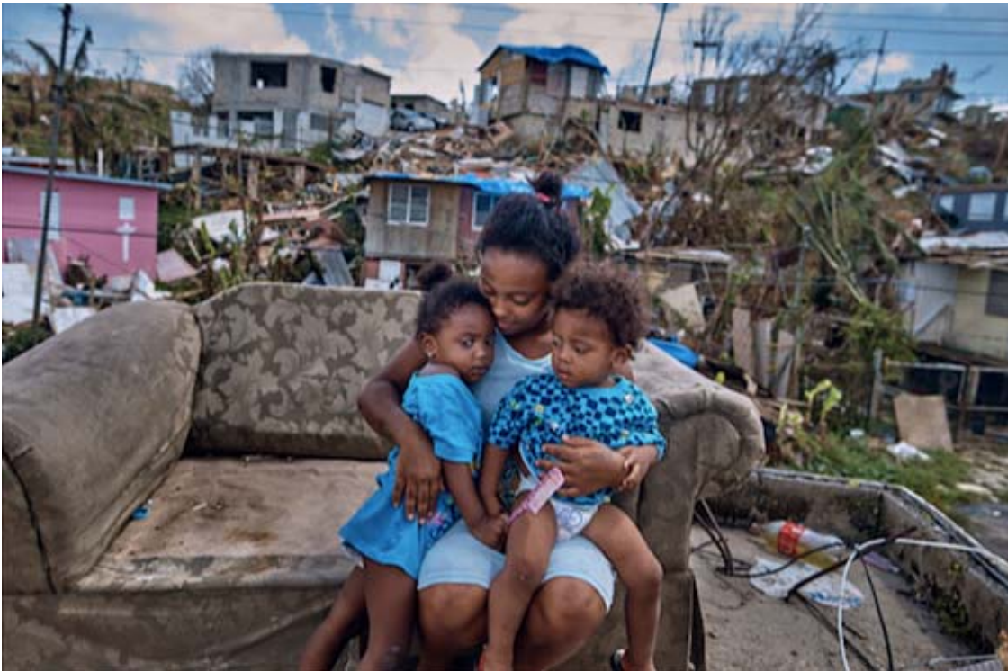
The Trauma of Weathering Hurricane Maria and Aftermath in Puerto Rico

“We are in an unprecedented and scary era where it is not mental health which intrudes upon the realm of politics — but politics which distorts our society’s mental health.”