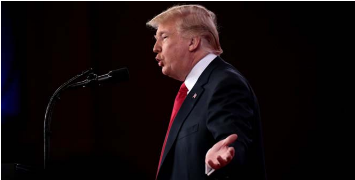
Donald Trump speaking at CPAC, February 2018

Essential to understanding Trump is his attempt to subject the public to his own solipsistic reality—and thereby destroy our shared basis for democracy.