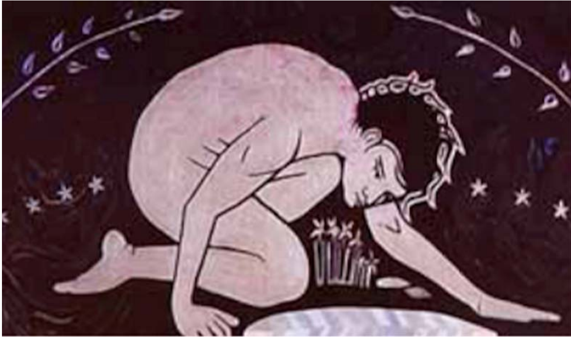
Narcissus gazing into pool that reflects his own image