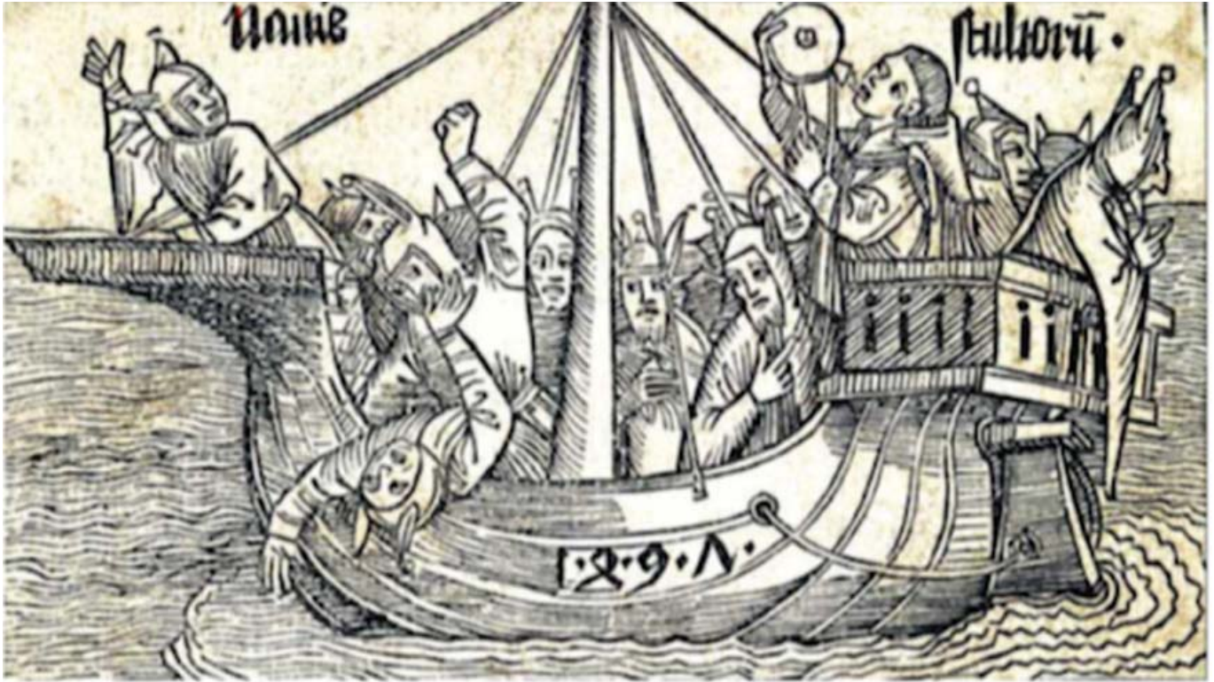
Albrecht Durer The Ship of Fools of Sebastian Brant, Title Page