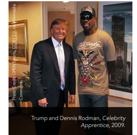
Trump and Dennis Rodman, Celebrity Apprentice , 2009.

analysis of his financial records reveals that he used his intelligence and deceit to operate a criminal enterprise.