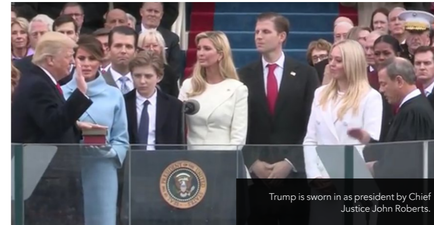
Trump is sworn in as president by Chief Justice John Roberts.