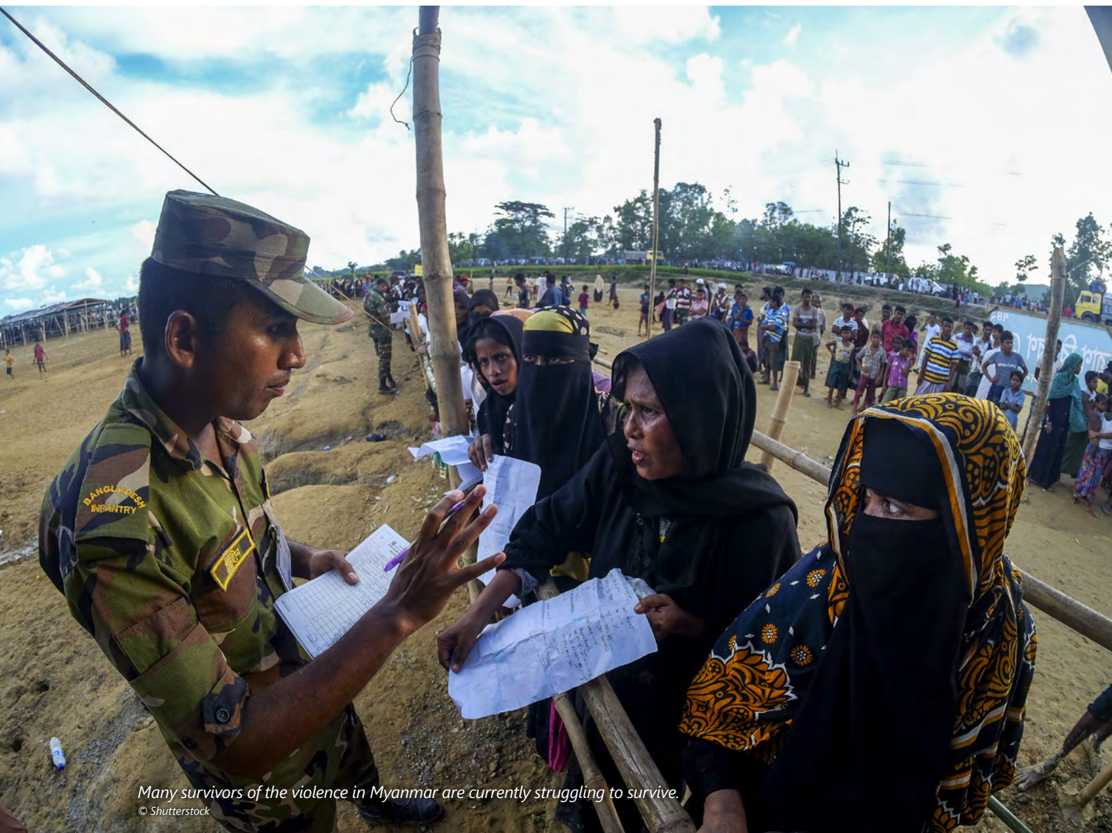
Many survivors of the violence in Myanmar are currently struggling to survive.