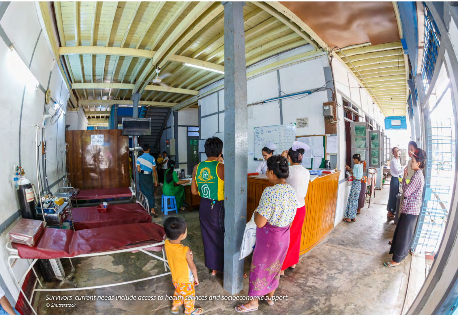
Survivors' current needs include access to health services and socioeconomic support.