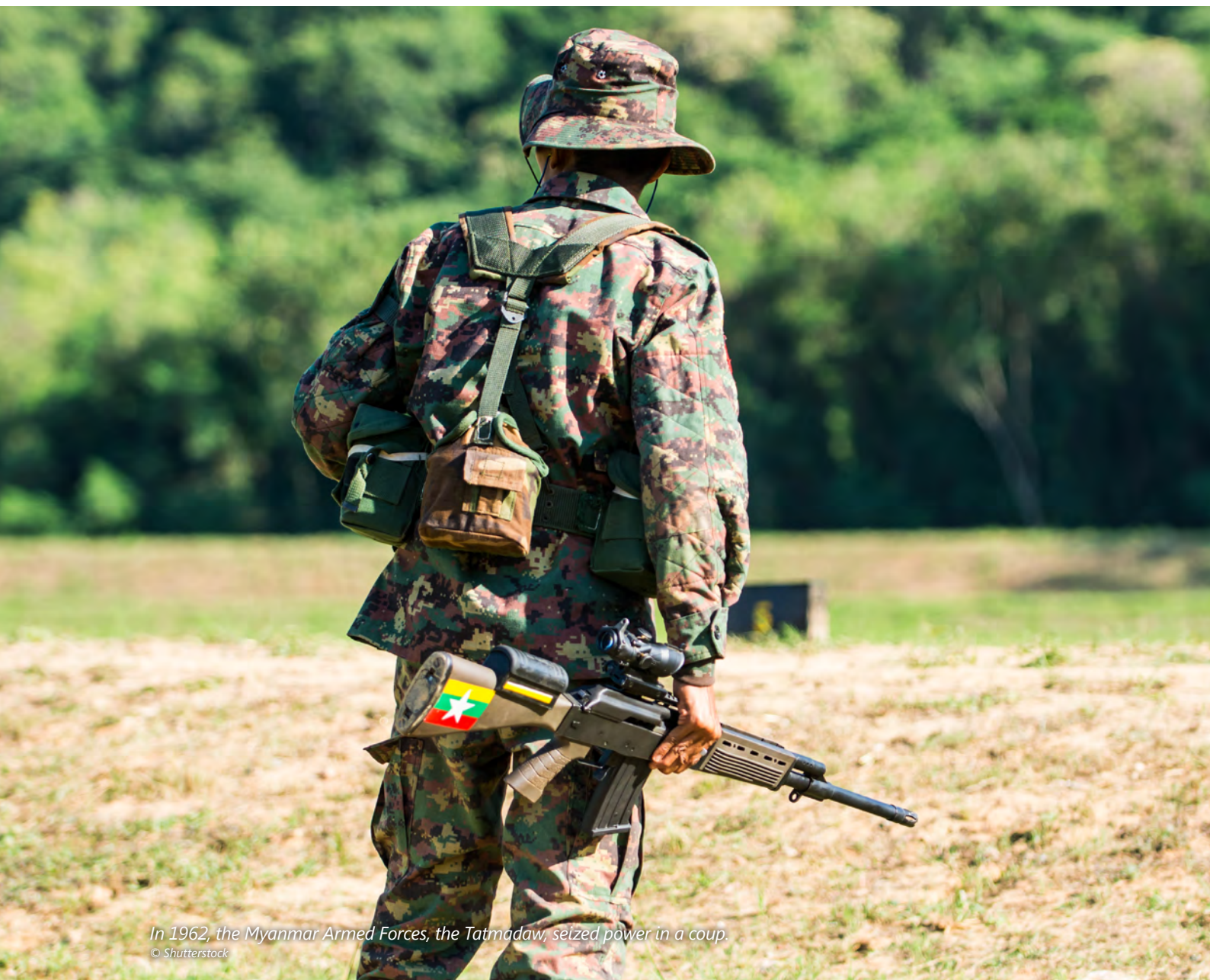
In 1962, the Myanmar Armed Forces, the Tatmadaw, seized power in a coup.

consultation. Given that this was not possible, this study draws on the views of the representatives of Myanmar CSOs and other stakeholders who were asked to convey what they believe to be the views and priorities of survivors; this provided much valuable insight. However, the fact that the findings in this study about the perceptions of survivors are based on second-hand information is an important limitation underscoring the need for further research to be conducted with diverse survivor voices at the centre.