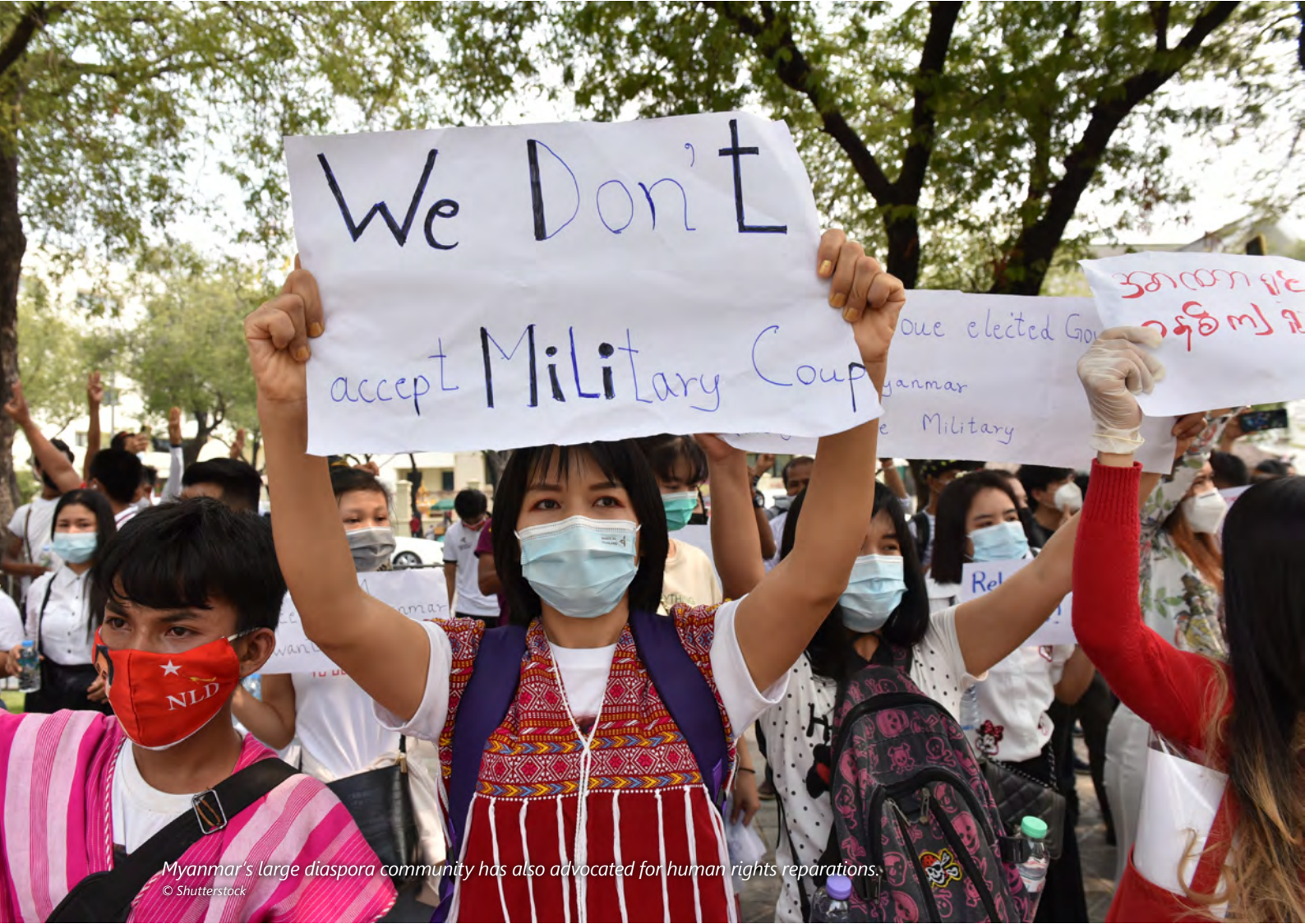
Myanmar's large diaspora community has also advocated for human rights reparations.