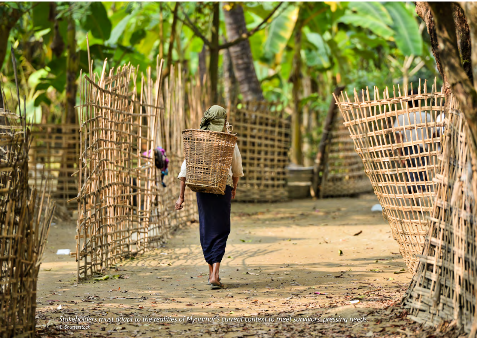
Stakeholders must adapt to the realities of Myanmar's current context to meet survivors' pressing needs.