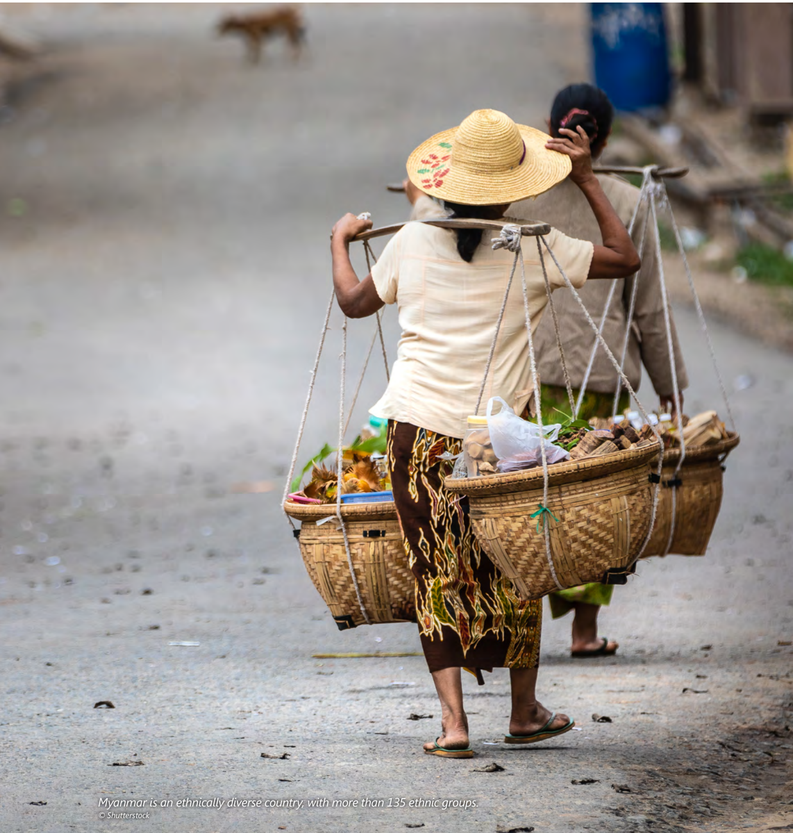
Myanmar is an ethnically diverse country, with more than 135 ethnic groups.