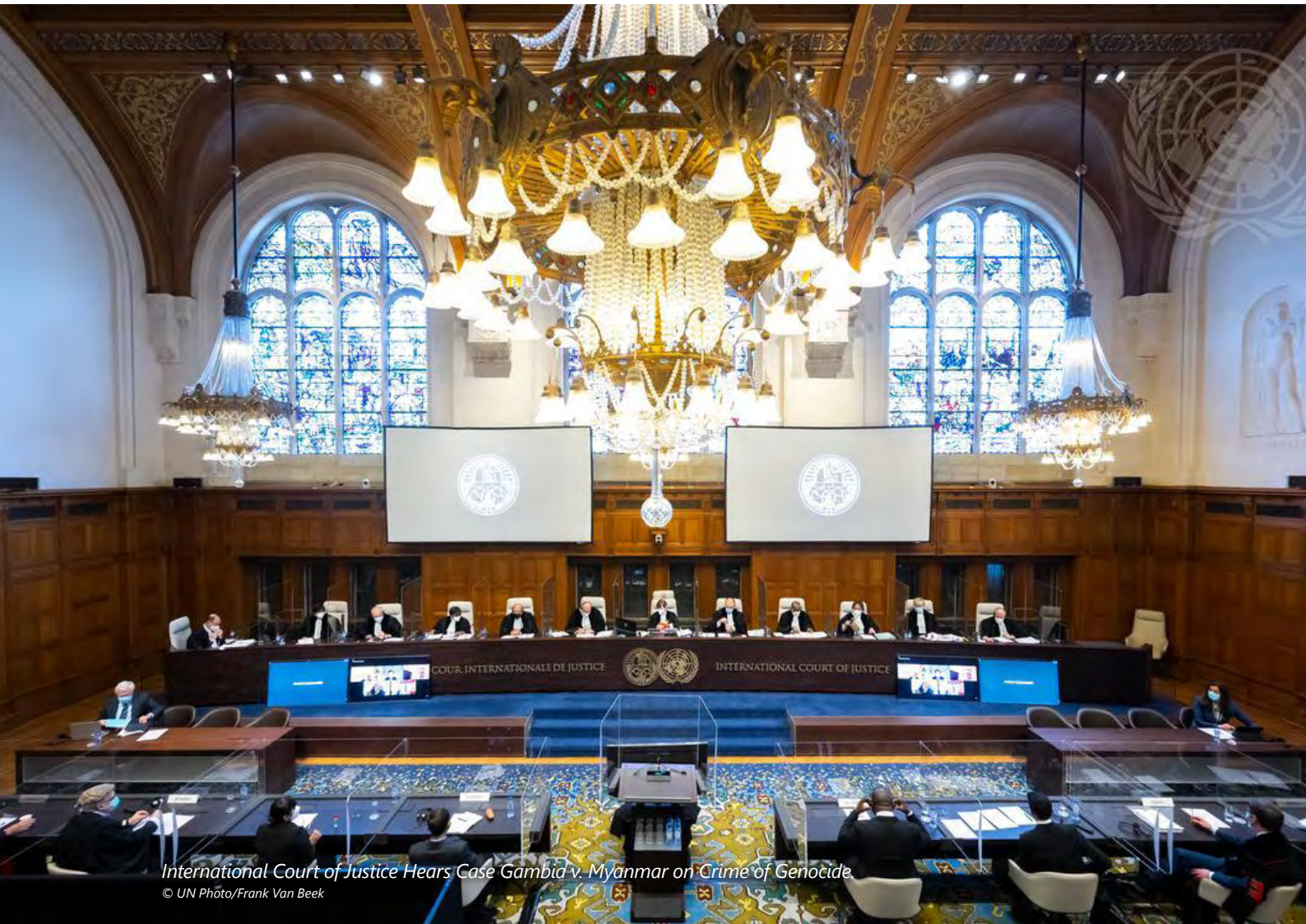
International Court of Justice Hears Case Gambia v. Myanmar on Crime of Genocide