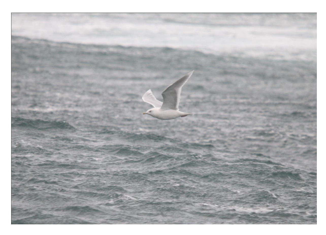
After our first afternoon's birding we retired to a smart hotel in Keflavik for a fine meal and a few drinks.