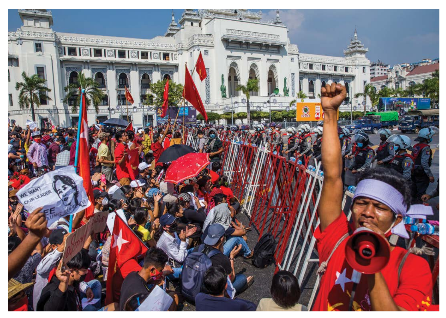
Protesters take part in an anti-coup demonstration in Yangon, Myanmar's largest city, on February 7, 2021, six days after the military deposed the democratically elected National League for Democracy government. The protesters in Yangon were joined by hundreds of thousands of others who marched in cities and towns across the country.