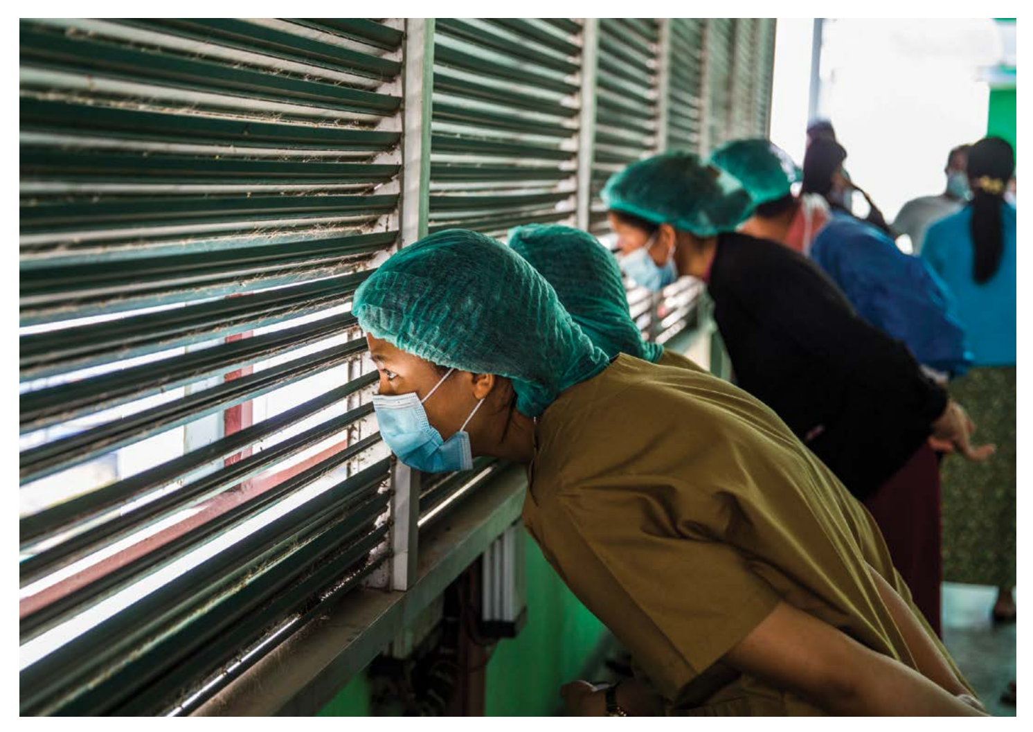
Health-care workers watch protesters demonstrating against the military junta in Yangon on February 28, 2021. Since the February 1, 2021 coup, many physicians and health-care workers have refused to work in government-run hospitals.

The junta's inept management of the COVID-19 pandemic does not end there. According to a study published in January 2022, regime officials deliberately undercounted the number of deaths and infections caused by the third wave of the pandemic between July and September 2021. Based on months of interviews with families, health-care providers, and funeral service organizations, the researchers found that the junta's COVID-19 data were based solely on cases treated in government-run hospitals and deliberately excluded cases and deaths that occurred outside the public health system. Although the junta reported 14,401 deaths during this period, interviews with funeral service groups suggested that the number of COVID-19–related deaths exceeded one hundred thousand.<sup>28</sup> With the Omicron variant of the COVID-19 virus arriving in Myanmar in January 2022, the number of infections and deaths can be expected to rise substantially over the coming year.