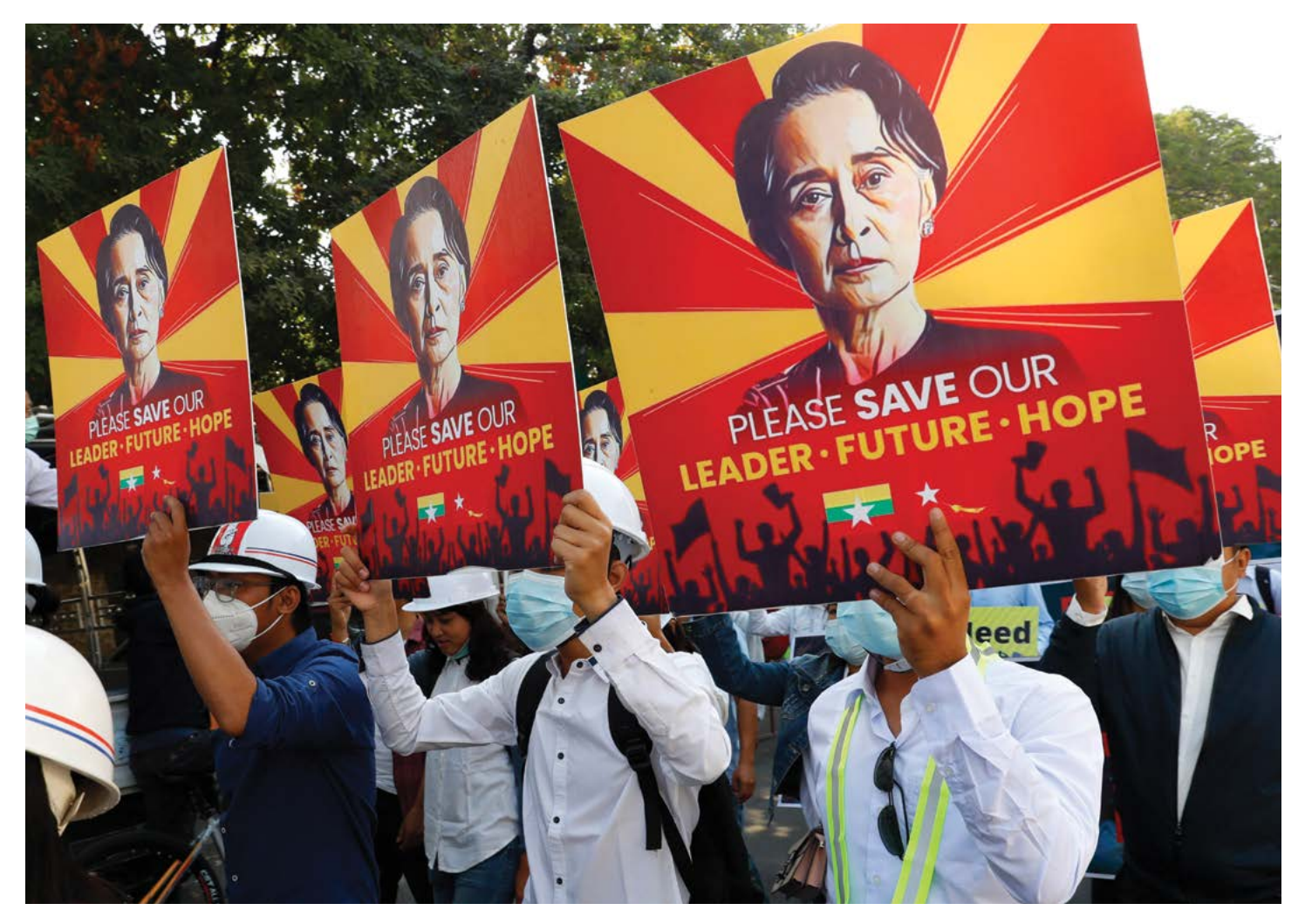
Anti-coup protesters hold signs showing deposed leader Aung San Suu Kyi at a march in Mandalay, Myanmar's second-largest city, on February 15, 2021. Aung San Suu Kyi and other senior members of the National League for Democracy government have been jailed by the military junta.

The coup has contributed to a regional and global health crisis. Myanmar's current unraveling has left the country unable to resist the rampant spread of COVID-19, adding to the pandemic's global health threat. In fact, the military regime is actively obstructing remedial assistance to most of the civilian population and even to a significant portion of the military. It is strongly in the United States' interests to assist regional institutions in coping with this threat, if only to arrest the spread of the disease throughout the world.