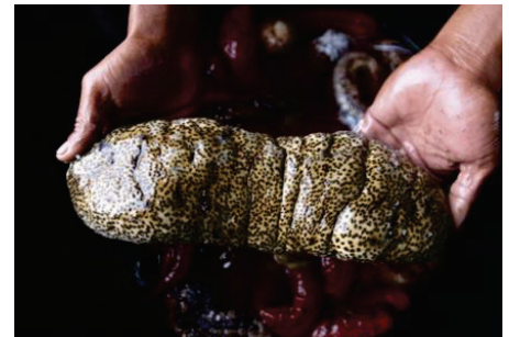
Figure 2. Sea Cucumbers