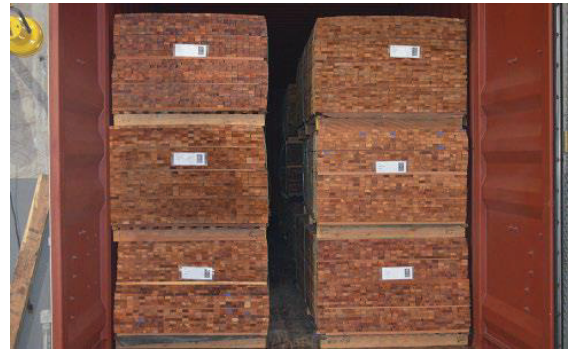
Figure 3. Lumber Seizure

According to CBP personnel and documentation, CBP personnel did not contact HSI special agents about the ivory and shark teeth necklace seizures. For the lumber, CBP personnel communicated with HSI special agents solely to obtain approval to post the seizure on social media. ICE's investigative assistance, including its broad legal authorities, could have been beneficial to the seizures' outcomes.