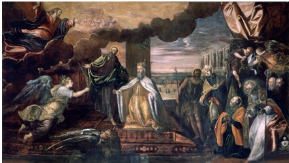
fig. 1 Jacopo Tintoretto and Workshop, Doge Alvise Mocenigo Attended by Saint Mark and Other Saints before the Redeemer , c. 1582, oil on canvas, Palazzo Ducale, Venice.