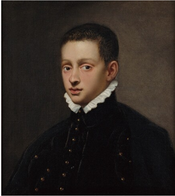
fig. 3 Jacopo Tintoretto, Portrait of a Boy , c. 1575, oil on canvas, Private Collection.