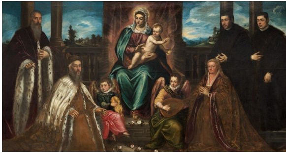
Jacopo Tintoretto Venetian, 1518 or 1519 - 1594