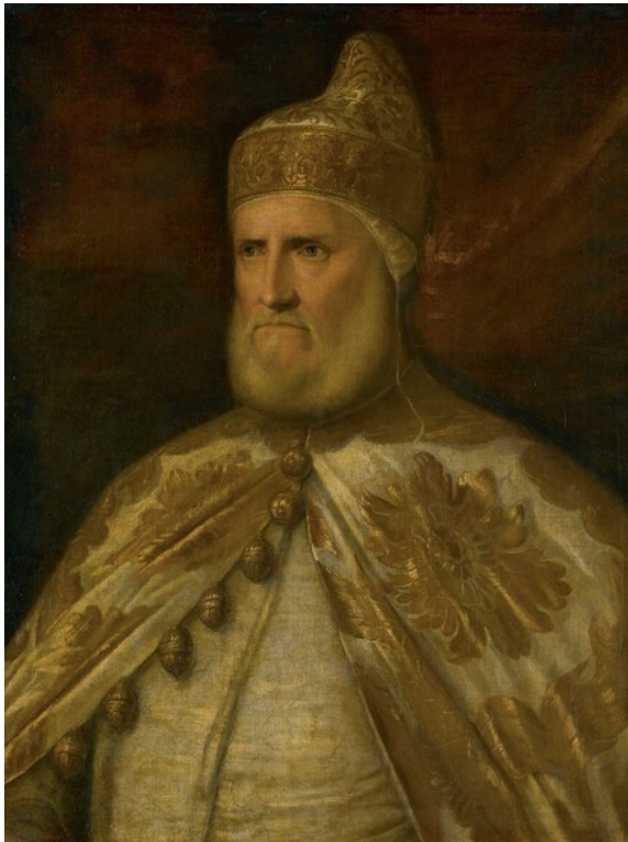
fig. 1 Workshop of Titian, Portrait of Doge Andrea Gritti , c. 1540, oil on canvas, Private Collection