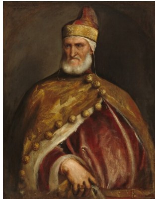
Titian Venetian, 1488/1490 - 1576