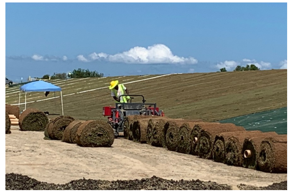
LPV-ARM 05 Installing HPTRM