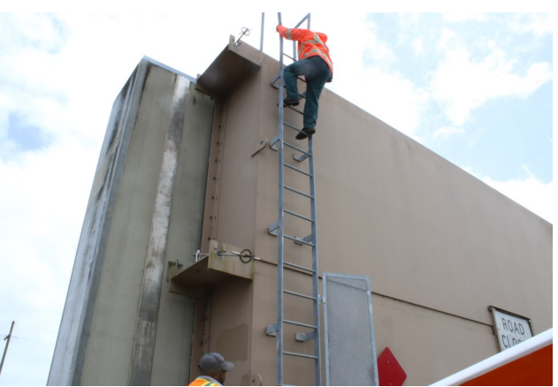
Above: FPA Maintenance crews close roadway gates.