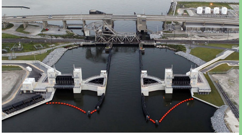
Seabrook Complex Structure