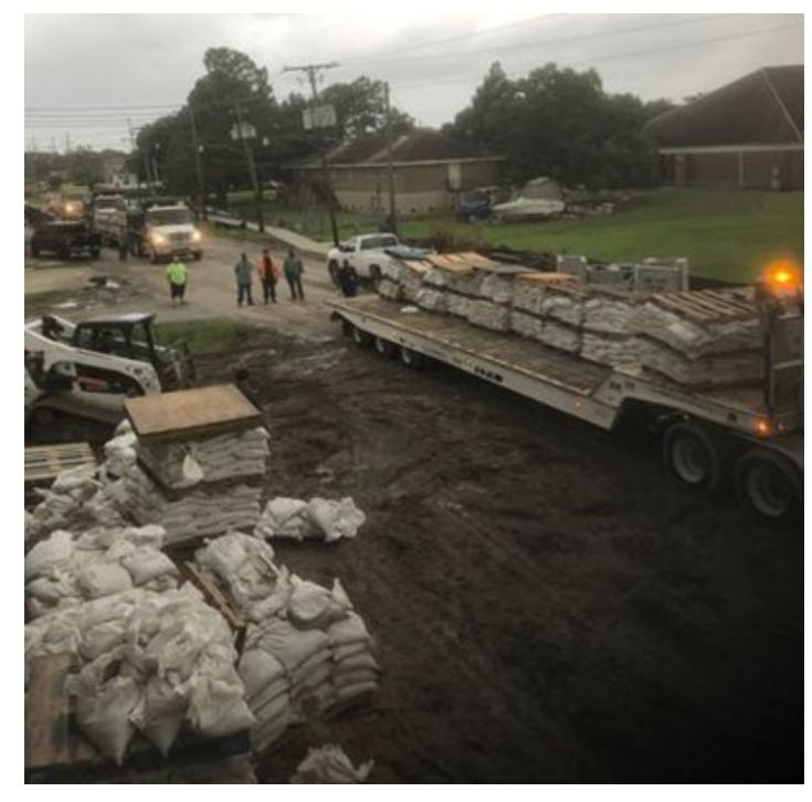
Delivering over 11,000 40-lb. sandbags to Lafitte

In addition, the FPA operates and maintains the following navigation structure gates: IHNC Barge and Sector Gates, Bayou Bienvenue Vertical Lift Gate, Seabrook Complex, and the Bayou St. John, Bayou Bienvenue and Caernarvon Sector Gates.