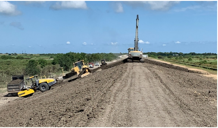
LPV - ARM-09 Constructing Levee Lift

LPV-ARM-09 - Project extends approximately five miles from the CSX Railroad to the IHNC Surge Barrier (LPV 111) and is still in the levee lift phase of work. The side slope flattening is complete, but the lifting of the levee is only about 30% complete. The contractor is planning to mobilize an Armoring Crew to the site within the next 10 days. The project is expected to be completed in June 2020.