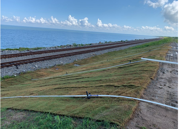
LPV-ARM 04 Irrigation System