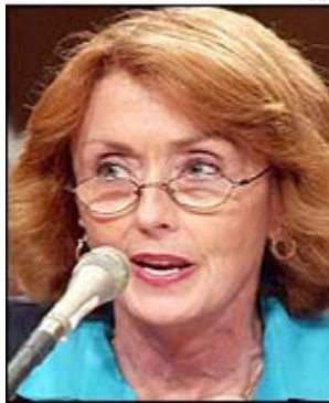
Ms Hill's staff studied 400,000 pages of documents

Ms Hill's statement came in the first public hearings held by the joint House of Representatives and Senate Intelligence Committee in its examination of 11 September.