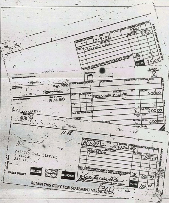
These are three of hundreds of credit card slips, obtained by The Washington Times, made out to Professional Services Inc. Names and card numbers of the customers have been deleted here, although they are on the originals.