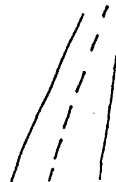
Figure 3. Target and response with a rating of 1.

I keep wanting to say — specifically — air-field landing strip. Flat land. Big airplanes would land here like naval carriers. Has a broken white line down the center of strip & you see it straight on — like you would be coming in for a landing.