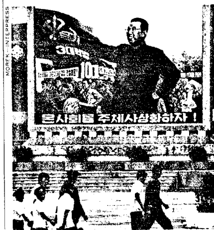
North Korea's Kim Il Sung points the way