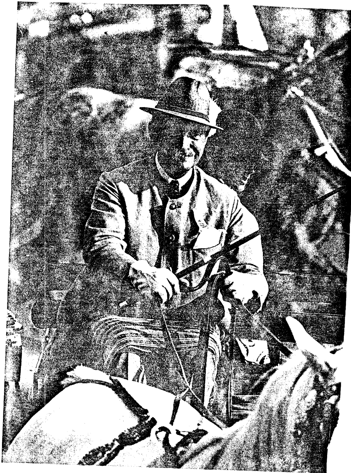
With style and Gemütlichkeit, a driver guides his team at the Volksfest in Kelheim, West Germany