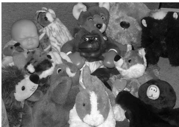
Figure 1. Toys used in my therapy room.